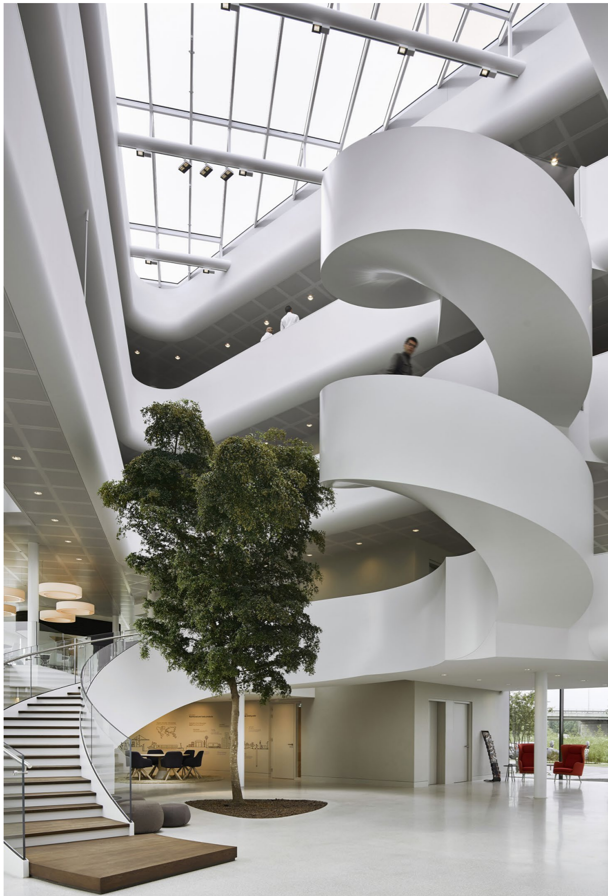
EeSoffit™ by EeStairs